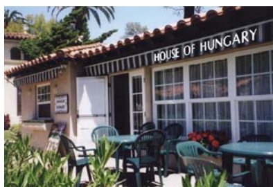
HOUSE OF HUNGARY NEWSLETTER – HÍRLAP June – July 2013