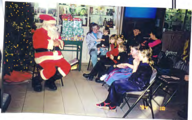
Santa Claus and children